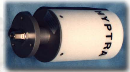
Reference: NE 0704