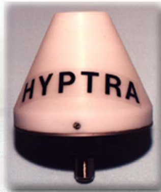
Reference: NE 0022