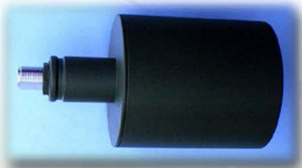
Reference: NE 0018

In option, when used in reception, the antenna can be equipped with filter and LNA.